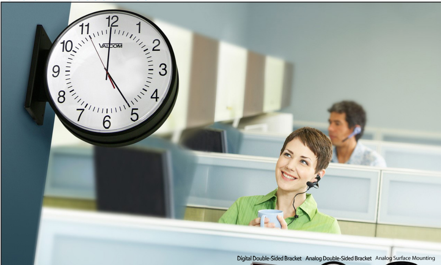
Digital Double-Sided Bracket Analog Double-Sided Bracket Analog Surface Mounting

Valcom offers a variety of mounting options for your clocks in order to accommodate all sorts of infrastructures, including surface and double mount housing, as well as, wire guards for clock protection.